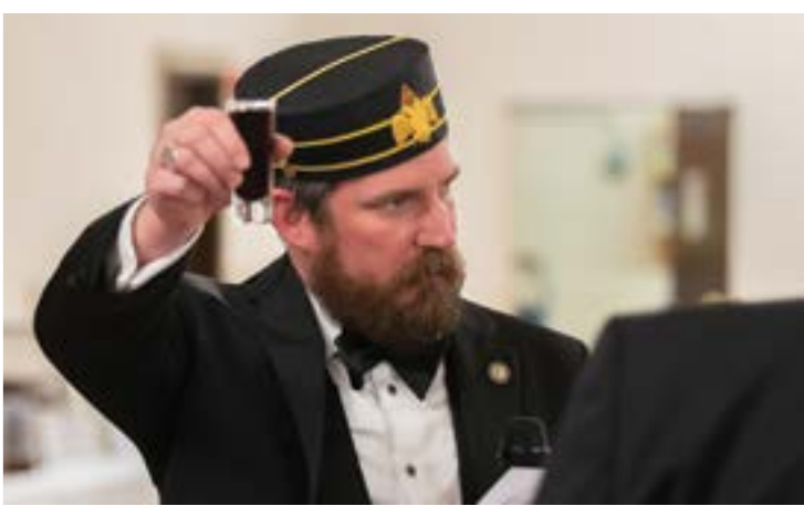
Spring Festive Board 2023