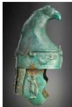
PHRYGIAN CAP, (also known as a Liberty cap)

We see the Phrygian cap being made of leather in the Hellenistic period and used as actual protective headgear. In ancient