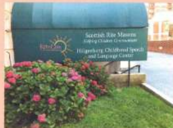
The Hilgenberg Scottish Rite Speech and Language Center 3800 N. Charles St. Baltimore, MD 21218

CALL 301-337-7893 To Schedule an Evaluation