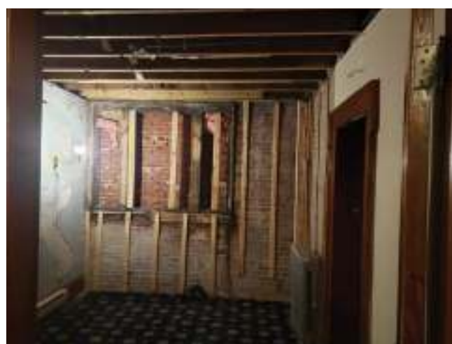
Above: Tyler's Room after restoration, Below: Tyler's Room before.