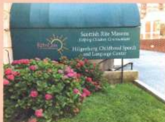
The Hilgenberg Scottish Rite Speech and Language Center 3800 N. Charles St. Baltimore, MD 21218

CALL 301-337-7893 To Schedule an Evaluation