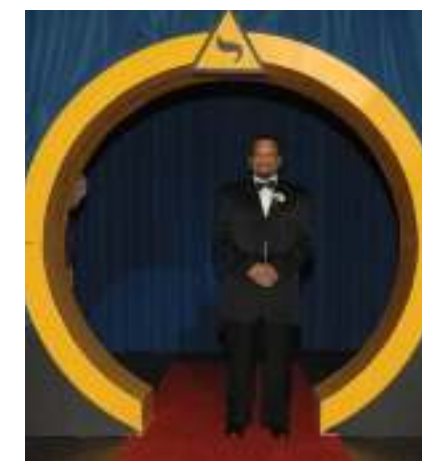
Rotimi Osunsan II