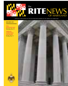
ON THE COVER Scottish Rite Temple, Baltimore