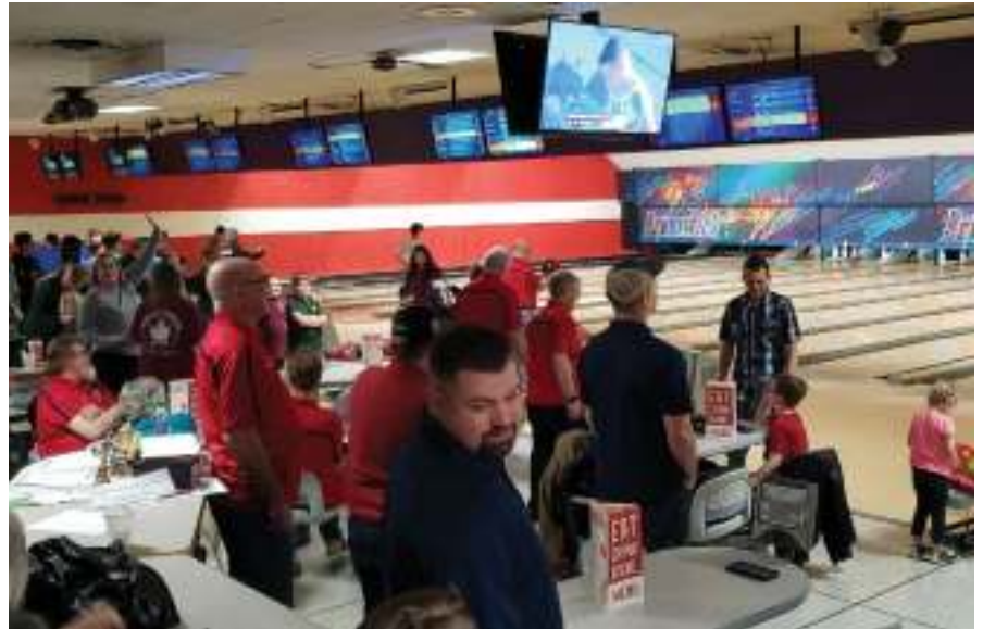
The Grand King's Bowling Tournament, held in conjunction with Maryland DeMolay.

The Grand Chapter introduced a new activity, The Grand King's Bowling Tournament. We had 4 Chapter's participate and trophies for High score and Low score were given. What made this tournament even special; it was held in conjunction with Maryland DeMolay. It was great to see the young men of DeMolay having fun and sharing Brotherhood together and with