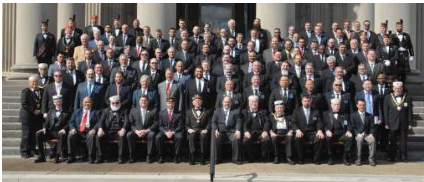
Spring Class of 2019