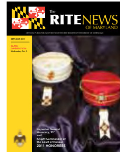
ON THE COVER 2011 Honorees

LOOK FOR US ON THE WEB www.mdscottishrite.org