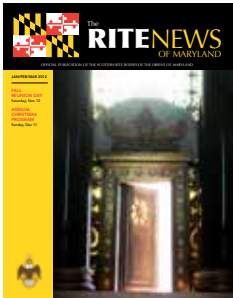
ON THE COVER Continue the Journey