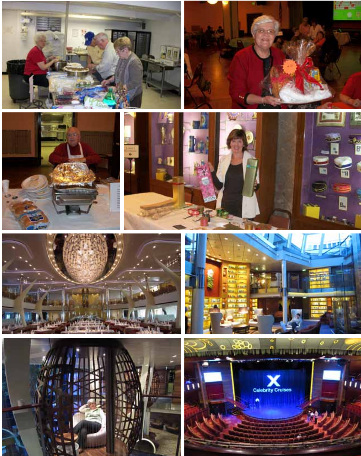
Pictures of the Celebrity Silhouette "Largest Ship Afloat" See Back of Magazine for Itinerary

Basket Bingo, Wine Tasting & Scottish Rite Caribbean Cruise