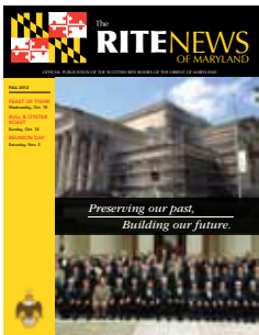
ON THE COVER Building our Future