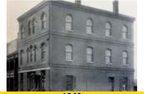
1869 Masonic Hall Harmony Lodge (top floor)