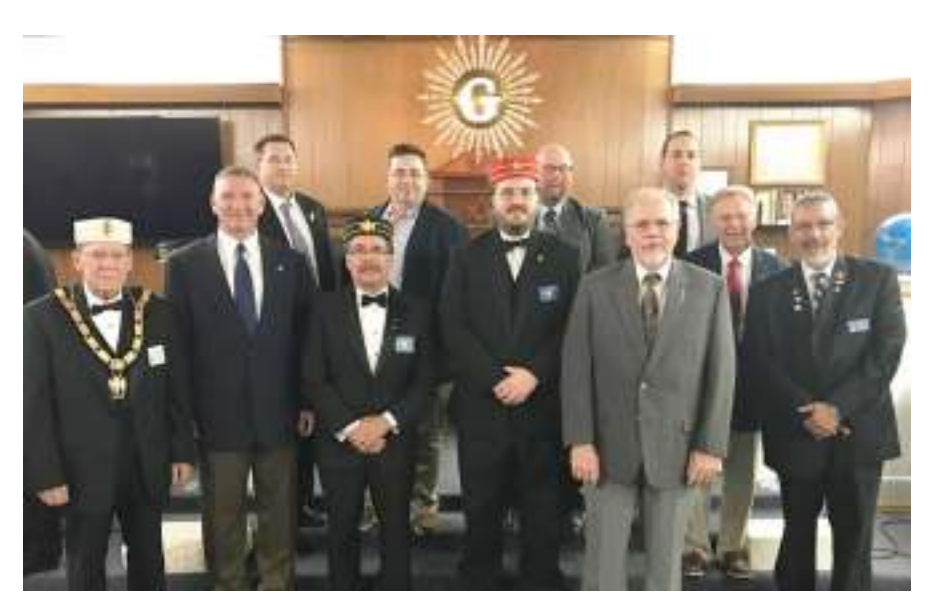
The Valley of Susquehanna traveled to Denton to confer the Scottish Rite Degrees on Saturday, September 9th, 2017.

REETINGS FROM THE Valley of Susquehanna! As we go into spring and a new season of growth and renewal, our Valley finds itself well into our 5th year of spreading the light of Scottish Rite Freemasonry in Harford and Cecil Counties. It is hard to believe that it has been 5 years already, and at the same time that it has been only 5 years. From humble beginnings in 2013, we have grown from 16 visionary Brothers forming the Chesapeake Lodge of Perfection to 82 members and have also established the Deer Creek Chapter of Rose Croix. With the generous and fraternal help of the Knights in the Valley of Frederick, we have established our own chapter of the Knights of St. Andrew as well. The fall of 2017 saw our traveling degree team at work once again, going to Denton, helping to welcome new Brothers into the Scottish Rite. As spring blooms around us, the