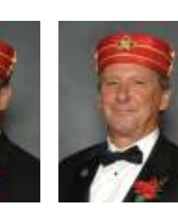
Valley of Baltimore