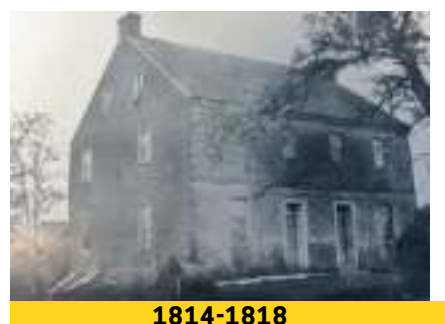
Krauss's Inn, near West Nottingham, Cecil County. First home of Harmony Lodge