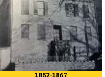
Paw Paw Building Meeting place of Harmony Lodge