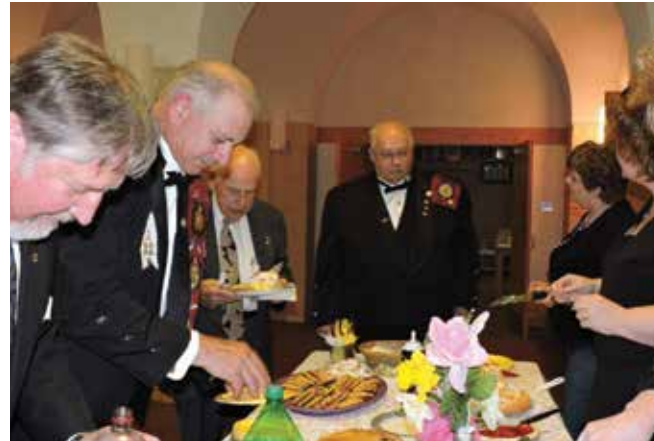
The men enjoying the refreshments served by the ladies.