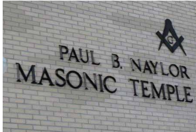
Oakland Masonic Temple (Taken April 2015) Weather was nice April, 2015!

MEMBERS OF CUMBERLAND SCOTTISH RITE traveled to Oakland, MD on April 20, 2015, to conduct a business meeting. Because of distance, many members from Oakland cannot attend meetings in Cumberland on Monday evenings at 7:30 PM. Eleven men from Cumberland and eight men from Oakland attended the meeting. Five wives were present and helped to serve refreshments after the meeting.